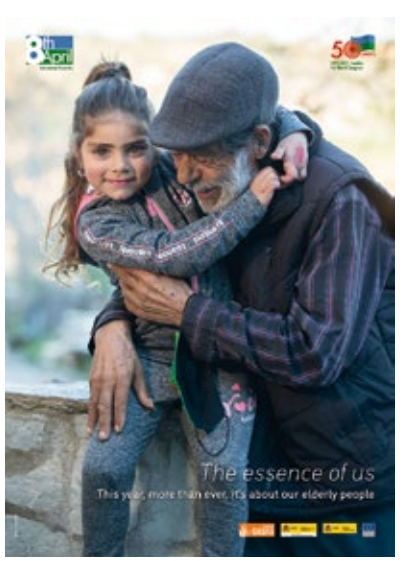
Poster for 8 April - International Roma Day 2021